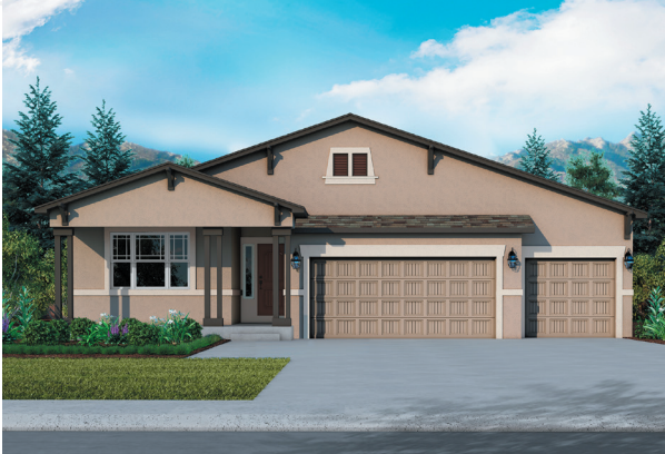
ELEVATION C w/ standard stucco

Main Level: 1,943 sq. ft. Lower Level: 1,952 sq. ft. Total: 3,895 sq. ft.