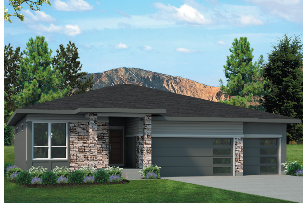
ELEVATION D w/ opt. stone