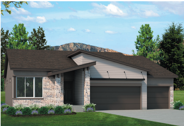
ELEVATION E w/ opt. stone